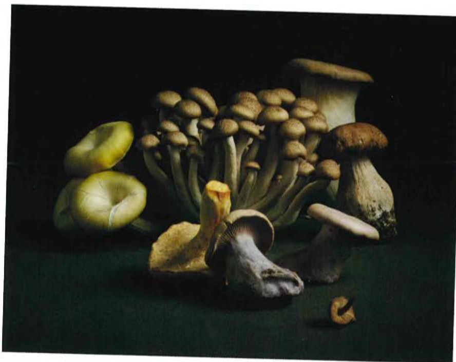
MUSHROOMS, CLOCKWISE FROM LEFT, YELLOW OYSTER, SHIMEJI, KING OYSTER, CEP, PIED BLEU, MOUSSERON AND GIROLLE. 'ADAMO & EVA' FABRIC IN 169 (CACTUS), £133 PER M, BY DEDAR. MEET OUR MODERN MUSHROOM HARVESTER AND MOONPHASE CONNOISSEUR ON PAGE 102