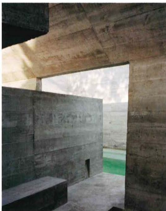
↑ CASA MÉRIDA BY ARCHITECT LUDWIG GODEFROY IN YUCATÁN, MEXICO, SEE PAGE 088